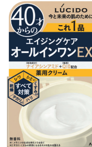
Used in paper packaging materials