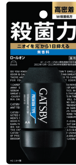
Used in mount part